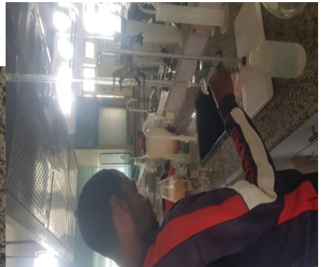
Titrating The Solution