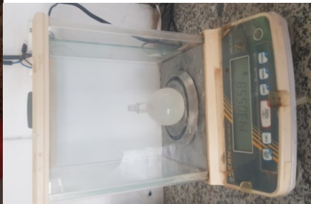
Measuring Specific Gravity