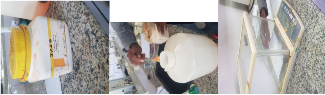
Yeast applying yeast in to jar measuring the mass of chemicals