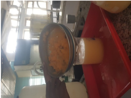
Filter The Papaya