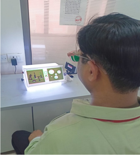
Figure 4: Exercise with vectogram.

required therapy for these types of patients. Slowly we can taper the amount of prism and exercises by observing the patient strength of controlling the squint. The main goal of these therapies is to decrease the recurrence of deviation by minimizing the angle of deviation or by strengthening the ability to control it and by reducing the symptoms [9].