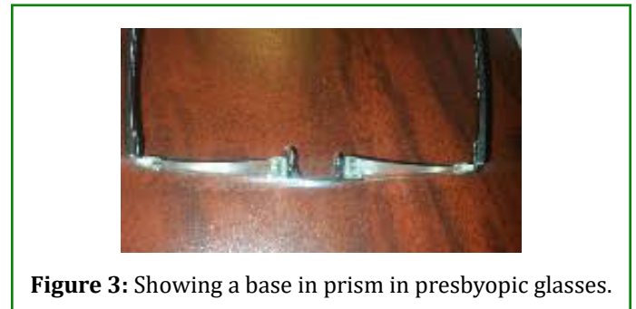
Figure 3: Showing a base in prism in presbyopic glasses.

A base in prism will help to control the exotropia. Glasses with addition power and base in prism will definitely help this kind of patient to control squint and maintain single and clearer image. The prescription in the amount of prism basically depends upon the amount of squint and the control of squint. In most of the cases we prescribe prism 1/4^{\text{th}} of the amount of squint but it is not the rule or compulsory method for the prescription, we also have to see the control of squint and also the vergence amplitude of the patients. Before prescribing prism we also have to give a trial and see fusing capability of the patient with the minimum amount of prism, this can be done with the help of brockstring or can also be done by making the patient read and ask if he can read for a longer period of time and ask if the words gets double or not in between and if he can control or not. After seeing all this we can prescribe the amount of prism where his ability to make images single and control for a longer period of time gets better Convergence exercises, in addition to prism glasses, can be beneficial for these patients.