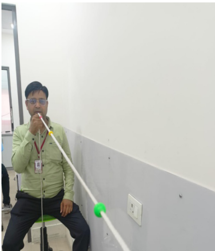
Figure 5: Exercise with brockstring.