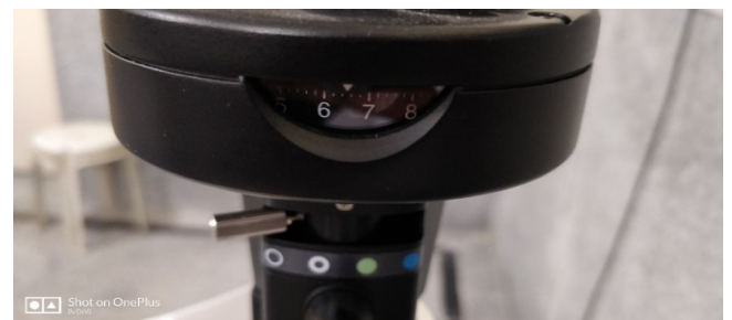
Figure 2: Dimensions taken from scale on the slit lamp.

Corneal epithelial defect was examined for dimensions under slit lamp after fluorescein staining using cobalt blue filter by making horizontal and vertical slits and taking measurement from scale on the top of the slit lamp by adjusting height of slit (Figure 2).