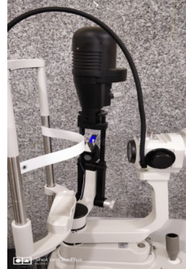
Figure 1: Slit lamp used for assessment of epithelial defect with cobalt blue filter.

complaints like ocular watering, irritation and discomfort and were diagnosed here as persistent epithelial defect under slit lamp after staining with fluorescein strip under cobalt blue filter (Figure 1).