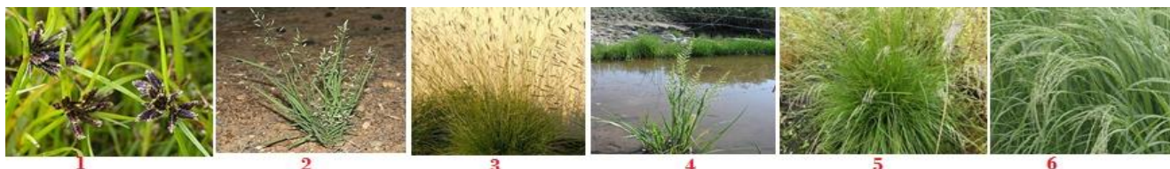
Figure 3: Five Grass species in the study area (1: Cyperus Fuscus , 2: Eragrostis Cilianensis , 3: Pennisetum sphacelatum , 4: Beckmannia syzigachne , 5: Deschampsia Cespitosa , 6: Eragrostis Tef ).

screened and morphologically similar colonies were clustered. Representative clusters were transferred in to YT/FF Micro Plate for Biolog Micro Station reading. Finally 27 fungal species (21 yeast and 6 filamentous fungus) were read by Micro station reader and the result revealed that 8 yeast species >0.5 similarity index and >75\% probability were identified. These are Fellomyces fuzhouensis , Schizoblastosporion starkeyi-henricii , Cryptococcus luteolus , Rhodotorula aurantiaca A, Cryptococcus terreus A, Trichosporon beigeli B, Rhodotorula aurantiaca , Cryptococcus albidus valerius . Whereas 19 Fungal Species Its Similarity Index Was Below 0.5. There for Eight Rhizosphere, Rhizoplane and Endophyte Yeast were fully identified from five Grass species in the study area (Figure 3, Table 2). Their percentage frequency on MEA media was recorded, the result revealed Trichosporon beigeli B (24.5%), Rhodotorula aurantiaca A (21.5%), Cryptococcus toreros A (20%), Rhodotorula aurantiaca B (17.5%), Cryptococcus luteolus (9%), Cryptococcus albidus valerius (7.5%). The Cryptococcus genera (36.5%) yeast was the dominant in this study. Filamentous fungi also confirmed by cellular morphology using Lactophenol cotton blue staining, the result revealed that Penicillium genera were dominant.