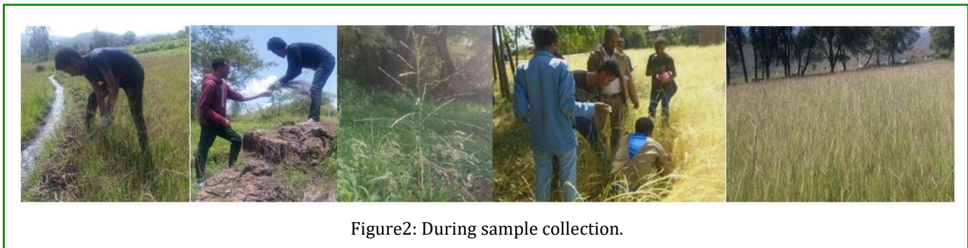
Figure 2: During sample collection.