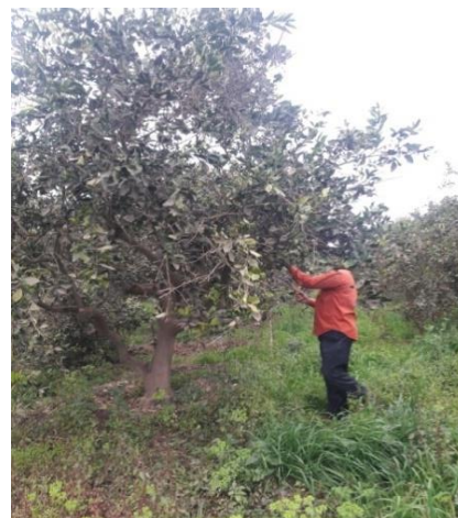
Figure 4: Field image for huge tree.

In different areas in Delta region orange tree grow up to different heights and maybe fruit picked by ladders due to high canopy (Figure 4), from another side, in high-density orchards many farmers left tree to grow up without trimming especially the old farms which cause a severe problem due to the internal area of canopy become shaded and poor or little fruit grown there, which reduce tree yield.