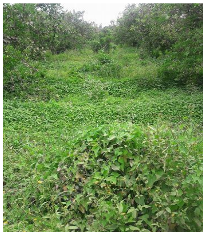
Figure 5: Field image for widespread of weeds in some citrus orchards in Delta region 2018

There are various weed species are grown in citrus orchards in delta region like Sorghum halepense (L.), Cynodon dactylon (L.), Convolvulus arvensis L., Cyperus rotundus L., Mercurialis annua L., but there are some dangerous kinds of weeds need urgently removed from orchards to avoid harmful damage like Arundo donax , Convolvulus arvensis and Imperata cylindrical [13]. In delta region due to using flooding irrigation system weeds growing quickly in orchards; weed density caused a decrease in the tree growth by about 15 to 96 % while reducing total yield up to 35% as a result of the adverse influence on fruit quality (Figure 5), the loss in fruit yield could reach to 35%, also, reduce the total yield and decline fruit quality [14].