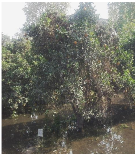
Figure 3: Field image for excessive irrigation in Delta region.

Management: The main purpose of irrigation is delivering the probable water quantity at the optimal time to the rhizosphere of the trees, furrow, basin and rings method are the most applied techniques of irrigation in citrus orchards under Delta region soil conditions [11]. Therefore, it needs to regulate since the establishment and adopts drip system of irrigation or another modern system to avoid sinking the trees and reduce nutrients leaching. The proper amount of irrigation water for citrus orchards in Delta region ranges from 9,000 to 11,000 m 3 per hectare yearly divided to 14-17 times through the year, irrigation intervals depend on the type of soil and climate conditions [6]. Due to critical situation for water in Egypt. Nowadays, some orange growers start adapt to drip irrigation or pop up irrigation system indifferent sites in Delta region to reduce quantity of irrigation water, decrease fertilizer loss, reduce infection by various soil pathogens, and minimize amount of fertilizers used to producing worthy yield with better fruit quality [12]. Furthermore, good drainage has an effective role in increasing the productivity of orange groves in clay soil under Delta region conditions.