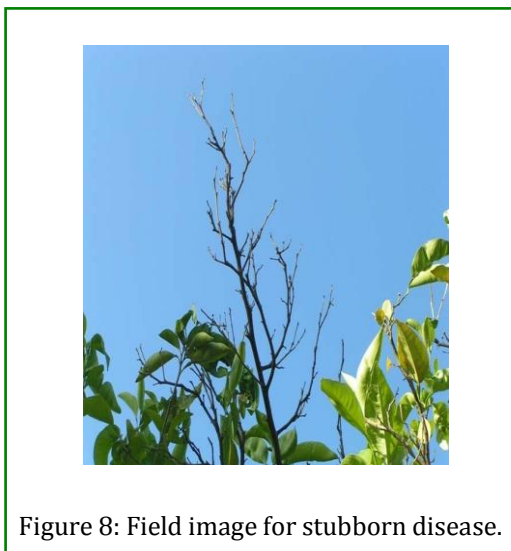
Figure 8: Field image for stubborn disease.

unique mycoplasma-like organism Spiroplasma citri . The disease infected Washington Navel trees more than other citrus variety (Figure 8), but infection may occur in Valencia, Sweet orange, and Grapefruit.