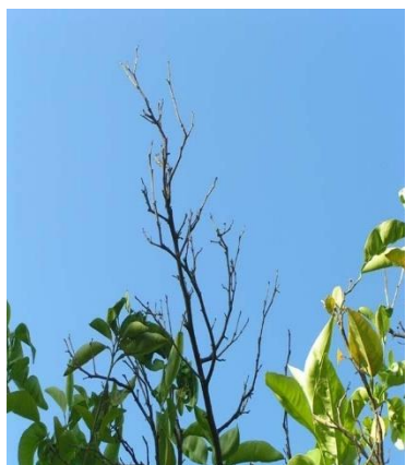
Figure 8: Field image for stubborn disease.

citrus variety (Figure 8), but infection may occur in Valencia, Sweet orange, and Grapefruit.