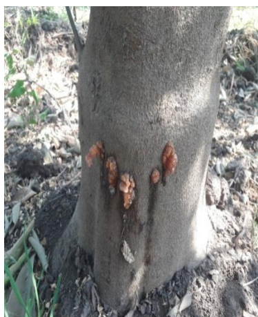
Figure 6: Field image for Gummosis disease symptoms on orange tree in Delta region 2018.

Gummosis disease ( Phytophthora gummosis ): The characteristic symptom of the disease is exudation of gum from the bark of the tree trunk (Figure 6). The bark shows conspicuous brown staining along with hardened masses of gum on the surface. The bark cracks open and in the later stages dry up and fall off, with severe infection the tree usually flowering heavily and dies before the fruits mature. Disease occurrence is particularly spreading in orchards established with the graft union at or below the soil surface and subjected to flood irrigation; also, severe losses also can occur if trees are planted on susceptible rootstocks like Volkameriana lemon.