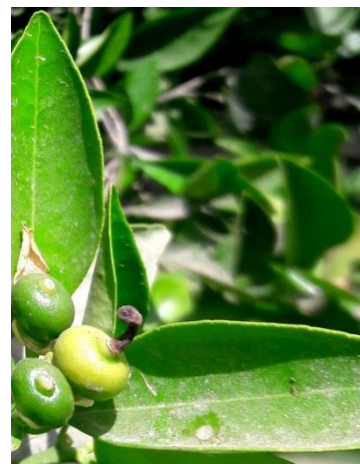
Figure 7: Field image for Alternaria Citri symptoms on orange in delta region 2018.

Alternaria fruit rot ( Alternaria citri ): Also called Black rot, it is a fungal disease caused by Alternaria citri , it could increase premature fruit drop, and also, infected fruits had masses of black fungal mycelium in the interior bulb. It is a very important disease in Delta region and causes a severe reduction in total yield for Navel orange orchards, also, Alternaria fruit rot is very affected in areas where citrus is processed for juice, because of juice contamination by fungal mycelium. Usually, the disease appears in oranges orchard especially in Navel orange orchards in Delta region (Figure 7), the fungus infection takes place throughout the citrus groves all over the world.