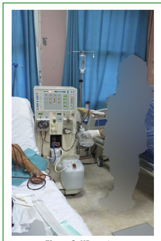
Figure 2: HD session.

The systematic virological assessment: before the start of dialysis sessions, then again every 03-06 months (microbiology laboratory). HCV antibodies using the Elisa 3 Architect i 2000 SR technique, specificity: 99.6%.VHC PCR with the Cobas Ampli Pre´p / Cobas Taq Man VHC-test1 kit, performed in patients (antibody VHC +), sensitivity: 99.1%. In addition to detecting HCV RNA, HCV genotyping is also required to predict response to treatment and to specify the duration and dosage of treatment. The Fibro scan assessment: carried in the hepatology department.