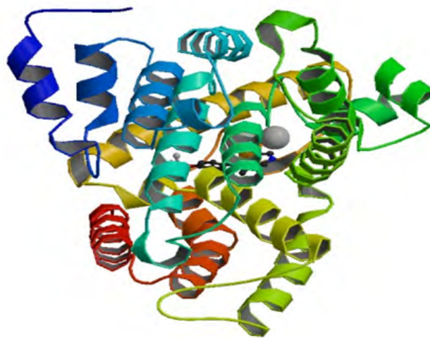
Figure 1b: Active sites of 1XMU; Ligand binding pocket of 1XMU is shown with predicted hydrophobic regions in yellow mesh, hydrogen bond donor surfaces in blue mesh and acceptor surfaces in red mesh.