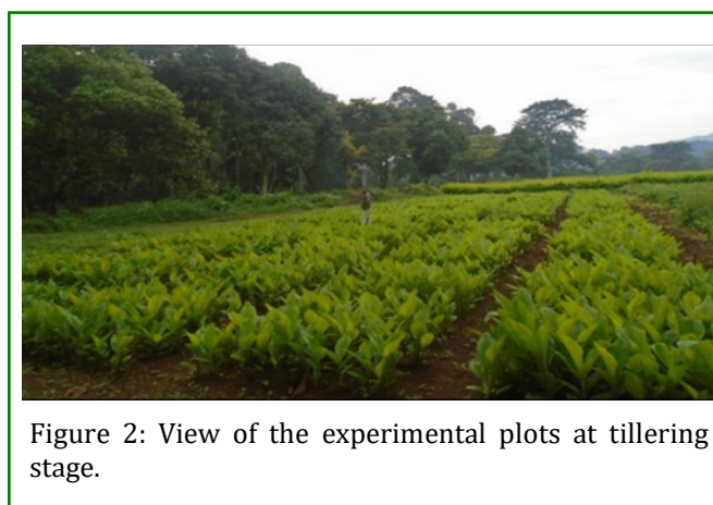
Figure 2: View of the experimental plots at tillering stage.

was maintained between the main plots and the sub plot, respectively, and a distance of 2 m was maintained between blocks. Each plot has six rows of which the four middle rows were used for data collection (Figure 2). The recommended rate of 23 Kg P 2 O 5 ha -1 Triple Super Phosphate (TSP) was uniformly applied to all plots at planting. Turmeric variety 'Dame', which was released by Tepi National Spices Research Center in 2007, was used for the experiment. It is a high yielding turmeric variety adapted to a wide range of altitudes from low to mid-altitude (up to 2000 meter above sea level) areas.